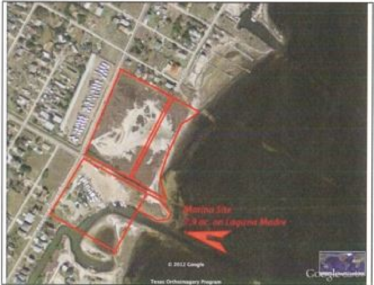
Primary Photo for 3909 Laguna Shores

1 3909 Laguna Shores, Corpus Christi, TX 78418