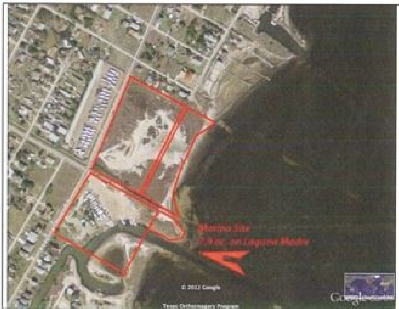
Primary Photo for 3909 Laguna Shores

1 3909 Laguna Shores, Corpus Christi, TX 78418