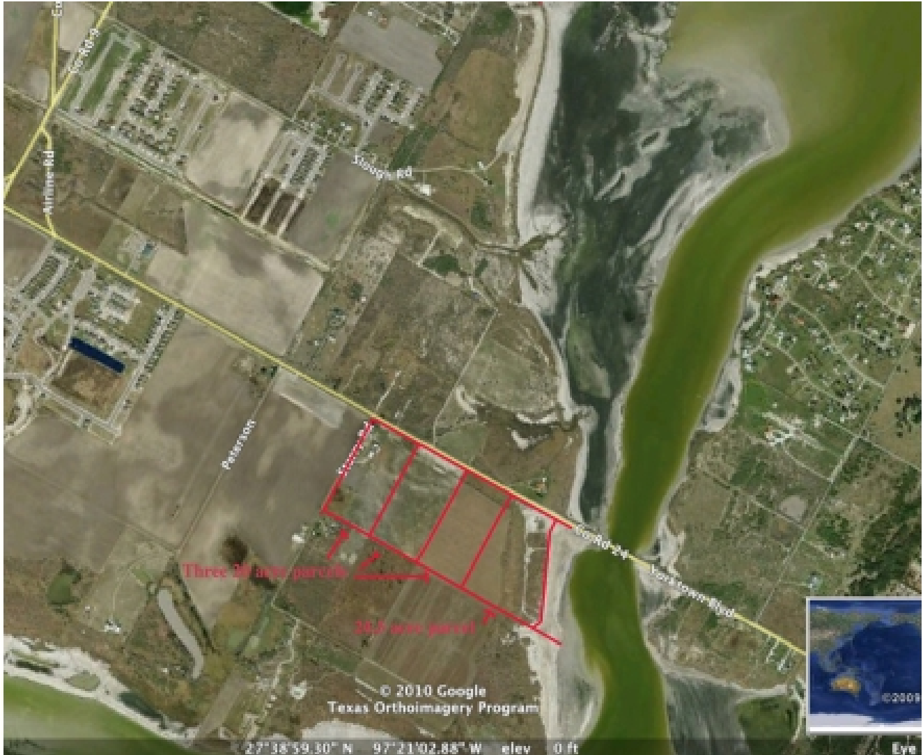
Primary Photo for Yorktown Blvd. @ Starry Lane, Corpus Christi, TX 78414